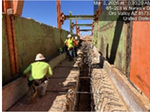
Inspecting reinforcing steel and forming on retaining wall 1.