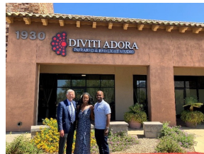
Diviti Adora Infrared & Red Light Studio 1930 E. Tangerine Rd., Ste. 100

For the third year, The Town of Oro Valley worked with StartUp Tucson and sponsored four free classes for entrepreneurs. We are happy with the results shown ( right ) and look forward to continuing this program in FY 2025/26.