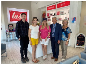
Amazing Lash Studio 7625 N. Oracle Rd., Ste. 105