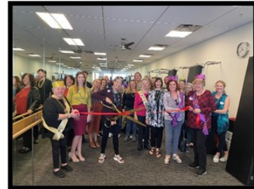
Swan Pilates 11901 N. 1st Ave.