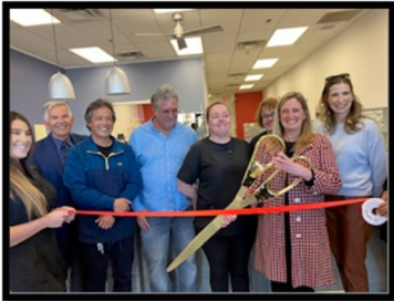
Velvet Hound Groomery 11941 N. 1st Ave., #141

Three businesses had ribbon cuttings in February. The Dollhouse Salon and Velvet Hound Groomery are new businesses in Oro Valley and Swan Pilates celebrated its third anniversary.