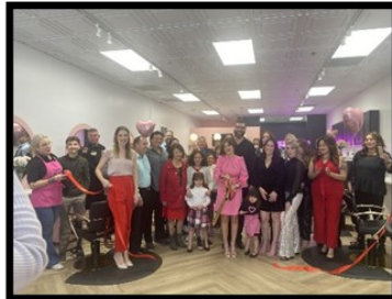
The Dollhouse Salon 1335 W. Lambert Lane