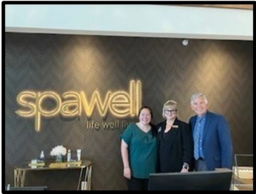
SpaWell at El Conquistador 10000 N. Oracle Road