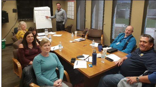
Staff participate in a review of the Utility's security and emergency preparedness program.