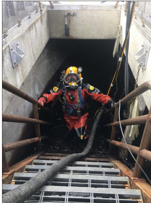
A certified diver prepares to clean, inspect and evaluate the condition of an Oro Valley water reservoir

Every winter, staff contracts with a diving company certified to clean, inspect and evaluate the condition of municipal water reservoirs. This annual inspection ensures the Utility's water reservoirs are in good working order and are prepared to provide continued safe, reliable and uninterrupted service.