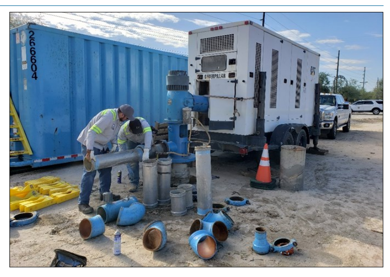
The sub-contractor to Smyth Industries, "Rain for Rent" installs the above -ground discharge piping so that pump testing can be performed.

Final well development work was completed by local contractor Smyth Industries. Pump testing is currently being performed to determine the sustainable water production for this well. Staff will begin the well-equipping design after the pump testing is performed.