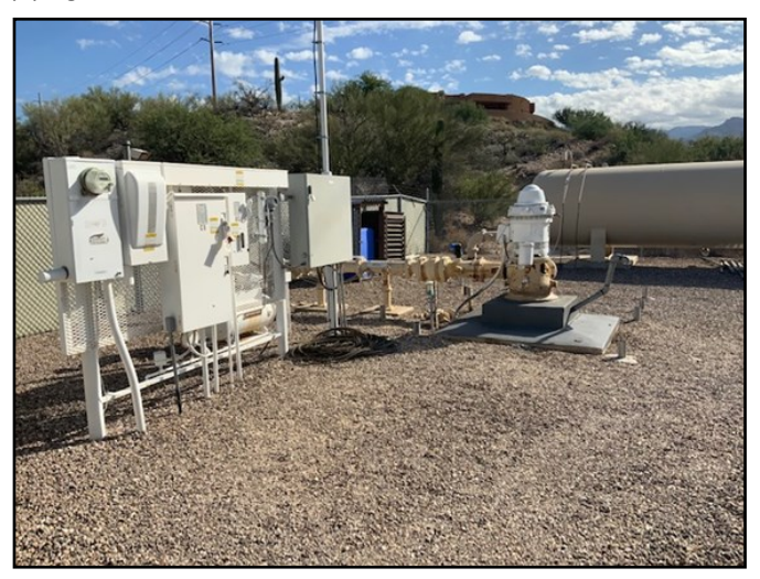
Pictured above is the well site prior to rehabilitation activities

The Water Utility has contracted with Smyth Industries to perform well rehabilitation work to Well C-8. The scope of work includes pulling the existing pumping unit, cleaning the well screen, re-equipping with a new pumping unit and above ground discharge piping modifications.