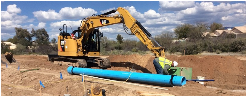
Pictured above the contractor prepares to install a 20-foot section of 12-inch PVC water pipe.

The water main relocation part of the La Cholla roadway widening project is underway and on schedule. The waterworks portion of the work included approximately one-mile of 12-inch PVC transmission main to be installed. The contractor is approximately 50 percent complete with the relocation work.