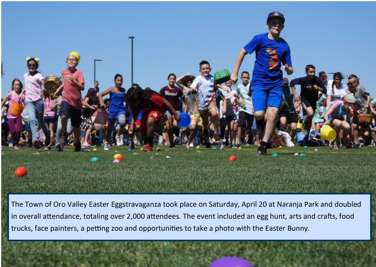
The Town of Oro Valley Easter Eggstravaganza took place on Saturday, April 20 at Naranja Park and doubled in overall attendance, totaling over 2,000 attendees. The event included an egg hunt, arts and crafts, food trucks, face painters, a petting zoo and opportunities to take a photo with the Easter Bunny.