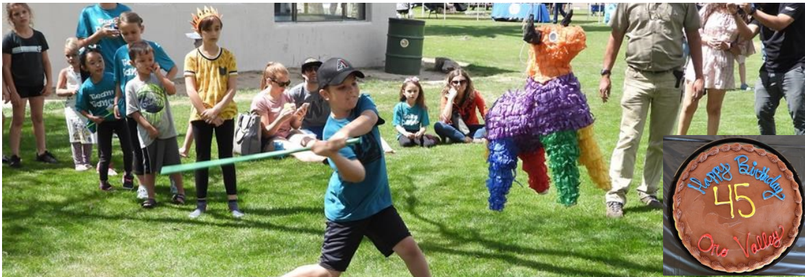
Cake photo by Sherri Graves

Celebrate OV was a smashing success this year! Approximately 3,500 to 4,000 people turned out to celebrate the Town's 45th birthday on April 13, which featured live music, equestrian demonstrations, dancers, Heirloom Farmers Market, a piñata and birthday cake!