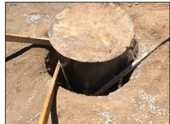
Arizona Beeman is the drilling contractor for the Nakoma Sky well. This well is a replacement for several of the Utility's existing older wells that are poor performers due to poor locations, antiquated construction methods and inferior construction materials.