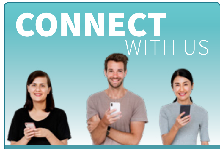
GET THE LATEST ORO VALLEY NEWS AND EVENT UPDATES

ants in our d mity, it arises for in the pande