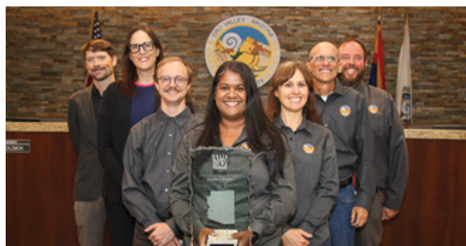
The project was led by the Planning Division, with support from staff in the Town Manager's Office.

The Community Engagement Plan for the upcoming General Plan process has been named winner in the Public Outreach category for 2023, as awarded by the Arizona Chapter of the American Planning Association. Public outreach is foundational to Oro Valley's General Plan, and that's why the creation of this plan included community involvement via survey and a resident advisory group to help us identify the best ways to engage our residents in the upcoming General Plan Process.