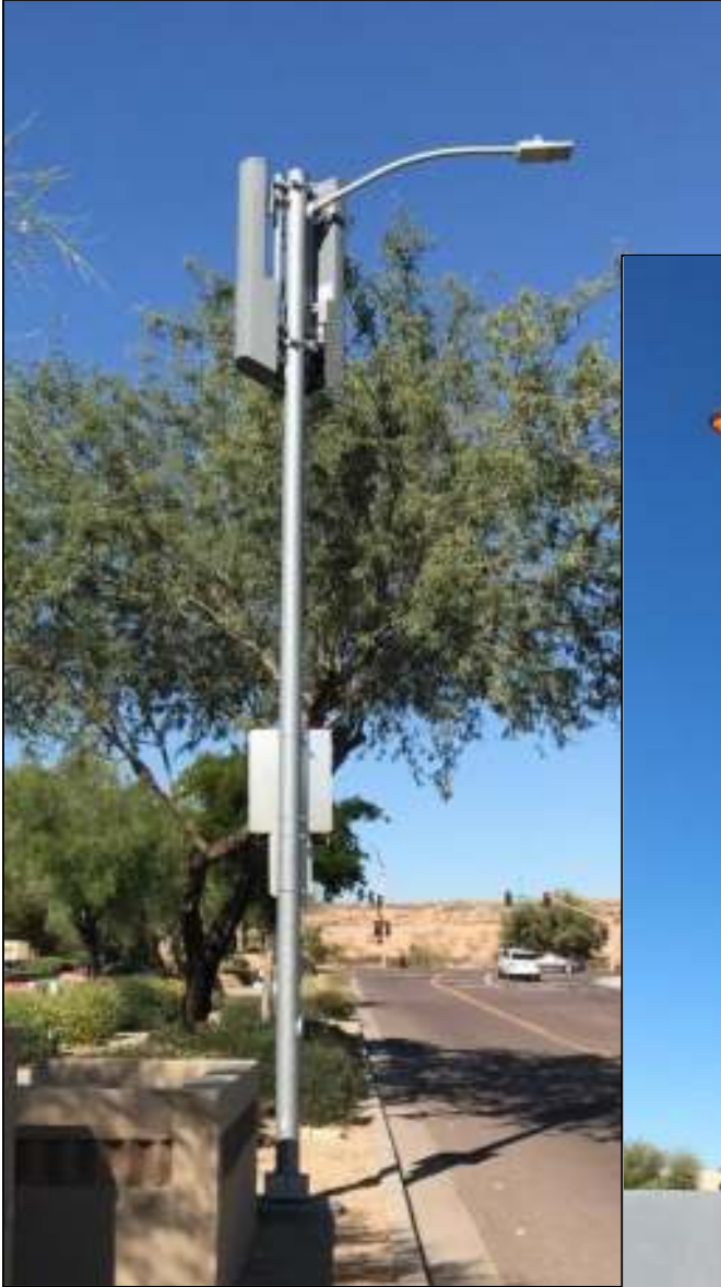
Exhibit D1 Antenna Shrouds – 45 Degrees