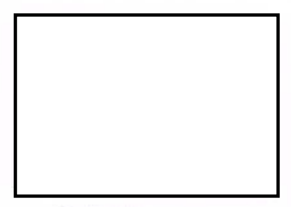
B – DEW380 White (-1) DUNN EDWARDS

ALL SIGNS TO BE INDIVIDUAL REVERSE PAN CHANNEL LETTERS PAINTED BLACK WHITE COLOR IS NOW ALLOWED FOR TENANT'S SIGNS FOR ADDITIONAL INFORMATION PLEASE REFER TO SIGN CRITERIA DOCUMENTATION