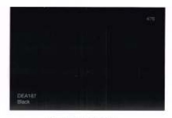
A – DEA187 Black DUNN EDWARDS