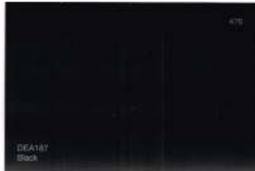
A – DEA187 Black DUNN EDWARDS