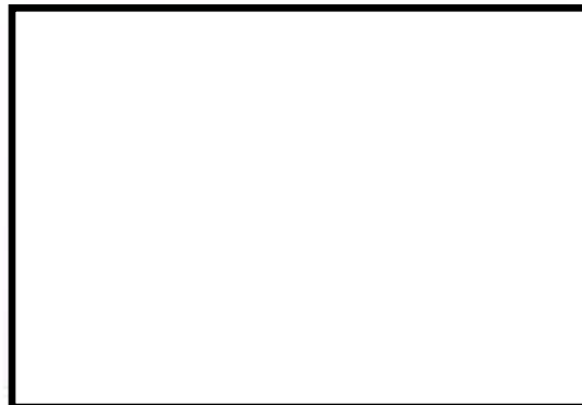
B – DEW380 White (-1) DUNN EDWARDS

ALL SIGNS TO BE INDIVIDUAL REVERSE PAN CHANNEL LETTERS PAINTED BLACK